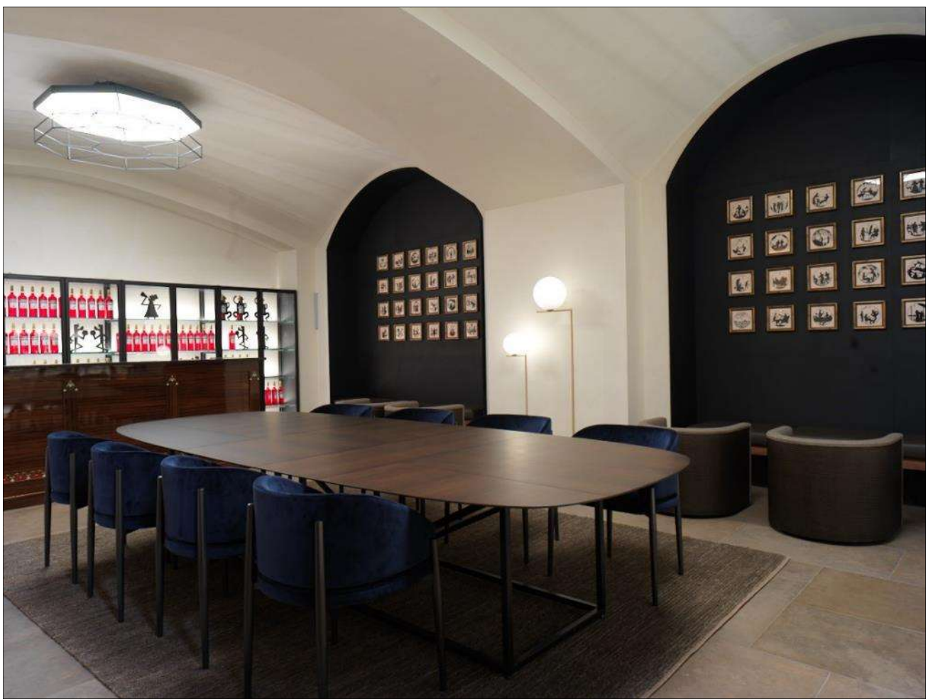
Lunch/Dinner VIP Set-up or Meeting Set up